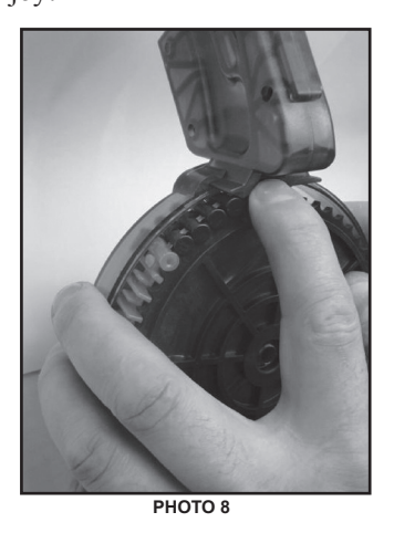
Note: The power spring may relax over time. This is expected and is not a bad thing. To adjust, simply take the drum apart and reset your wind to 1 \frac{1}{2} - 2 turns.